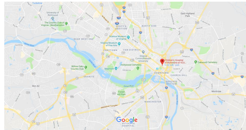
Map data ©2019 Google 1 mi